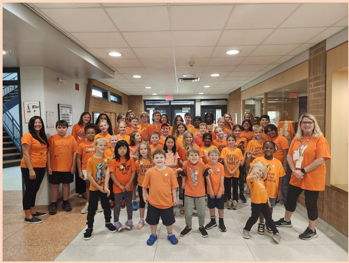
Our school participating in Truth and Reconciliation Day by wearing orange. Way to go Knights!